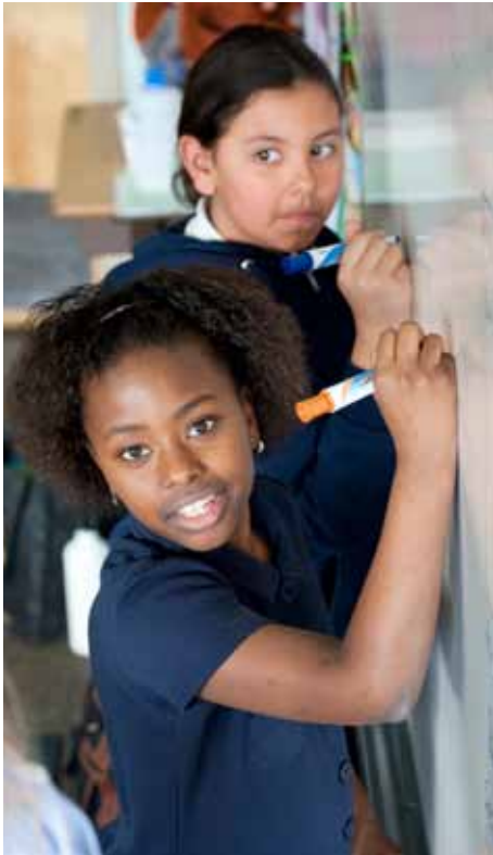
I Have A Dream, Portland