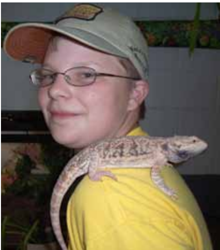
4H member at the Union County Fair

OCF plans to use the many tools available to a community foundation to help Oregonians change the state for the better. OCF envisions its own transformation in the process. Building on a bedrock of quality services to donors and support for nonprofits, OCF will foster leadership and problem solving in which its board, volunteers, donors and staff are active participants, encouraging Oregonians to find common ground and new solutions from local neighborhoods to the state capitol.