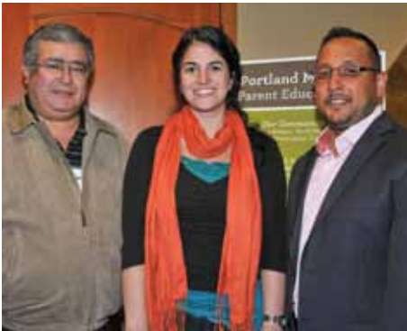
OCF Leadership Gathering, Bend