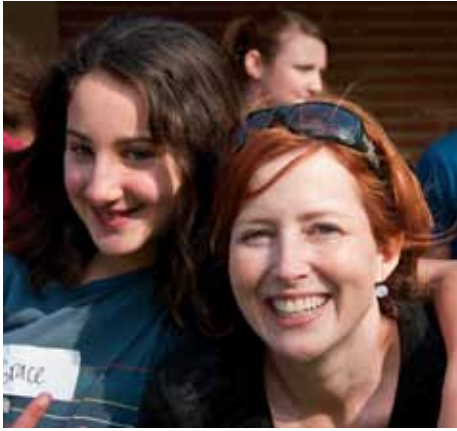
Committed Partners for Youth, Eugene