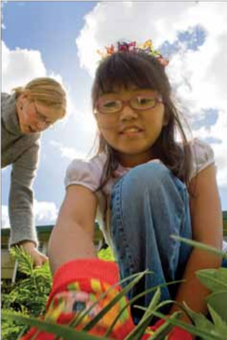
Growing Gardens, Portland

In the next five years, OCF will expand its strong tradition of outreach and partnership with donors through: