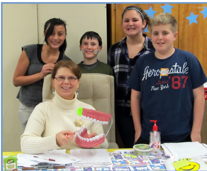
Middle school students huddle up to learn about tooth decay.