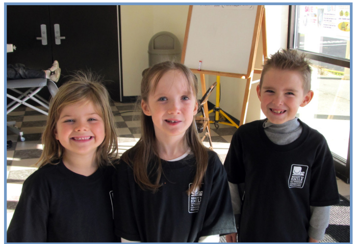
Three students are ready to smile after brushing their teeth.