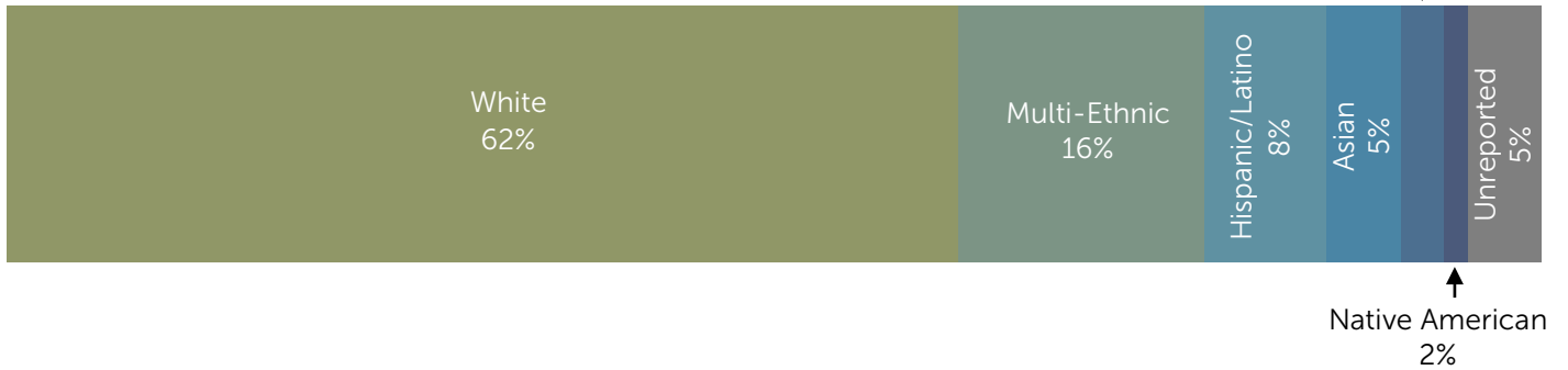
Figure 1: 34% of OCF scholarship recipients identify as non-white. 1